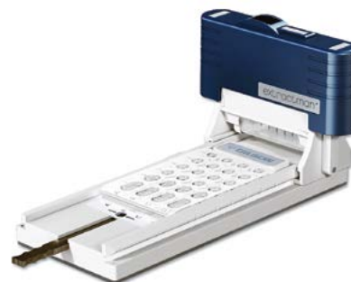
Figure 1 EXTRACTMAN for processing of magnetic bead-based molecular biology kits