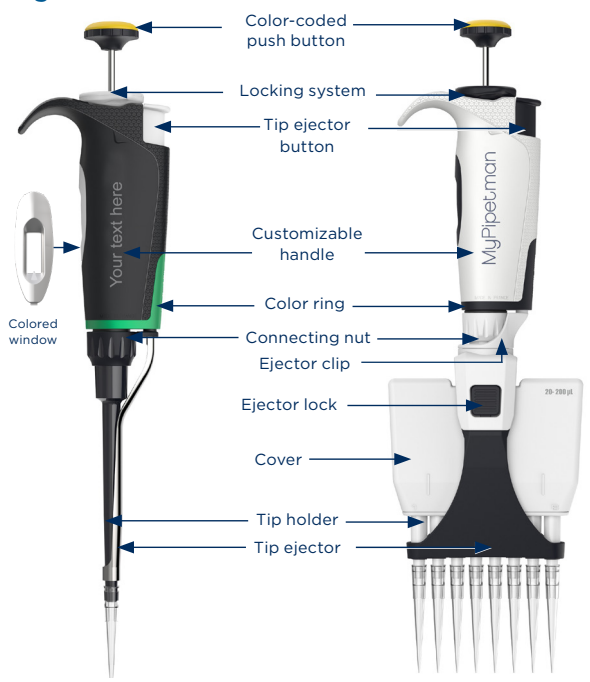
Figure 1 MYPIPETMAN® single channel and multichannel model components