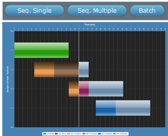
Figure 2 TRILUTION® LH Software Sample Run Type Options (Seq single, Seq Multiple, Batch) and Scheduler Display