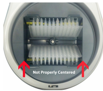
Figure 2 Example of Improperly Balanced Rotor